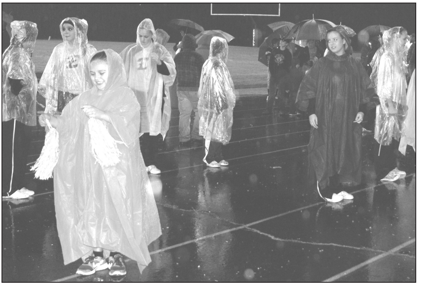
The weather didn't exactly cooperate for Friday night's Tackle Breast Cancer.

TWIN CITY CAR WASH Hand Wash River Dr. & Main, Ravenna Detailing Available! Call 606-465-1821