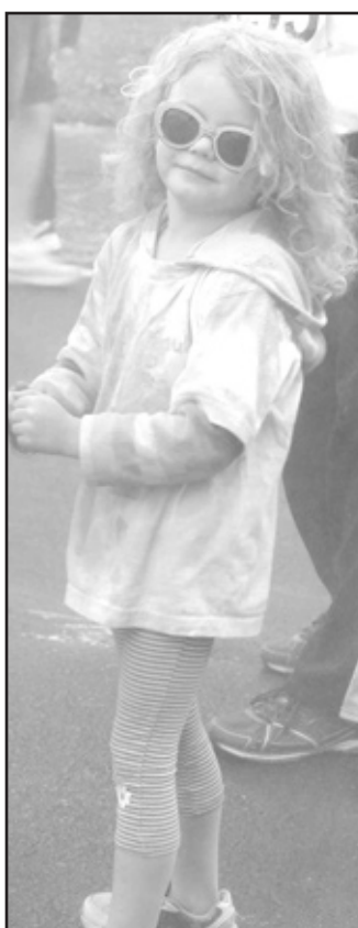
This young lady somehow ended up all pink following the walk/run on Saturday.