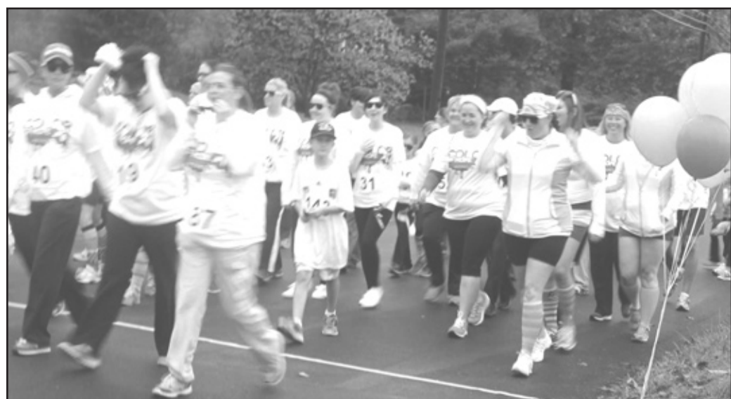
All shirts were white at the beginning of the race. By the time, the participants walked or ran the 5K, they were all different colors.