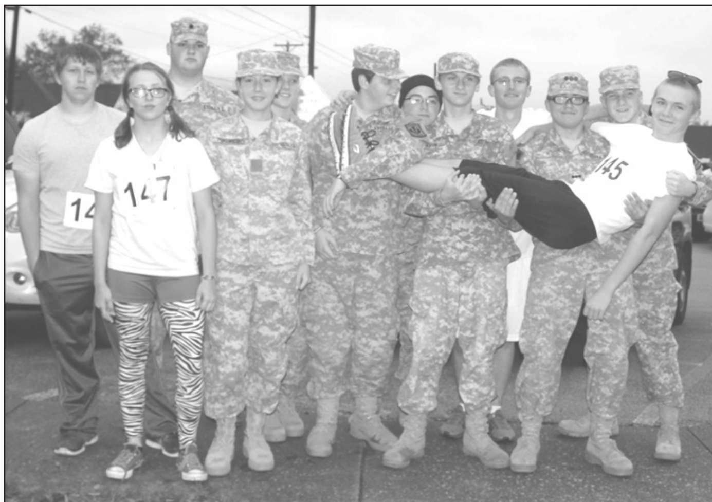
The Junior ROTC from Estill County High School assisted with the Hospice 5K Color Run/Walk on Saturday.