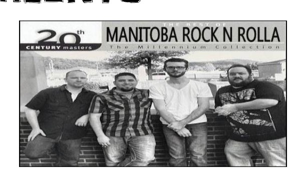
Manitoba Rock n Rolla