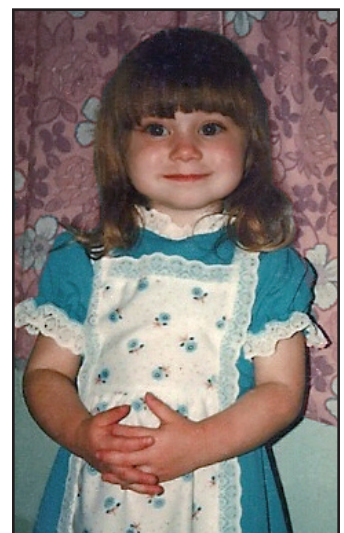
Lordy, Lordy! Look Who's 40! Love, your family Happy Blithday