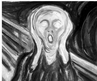
Detail of The Scream of Nature by Edvard Munch (1910)

© 2014 by King Features Syndicate, Inc. World rights reserved.