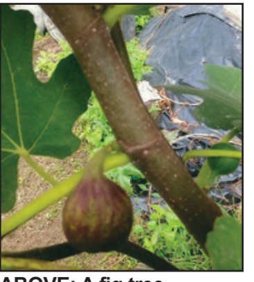
ABOVE: A fig tree. AT RIGHT: "Pup" rounding up the chickens