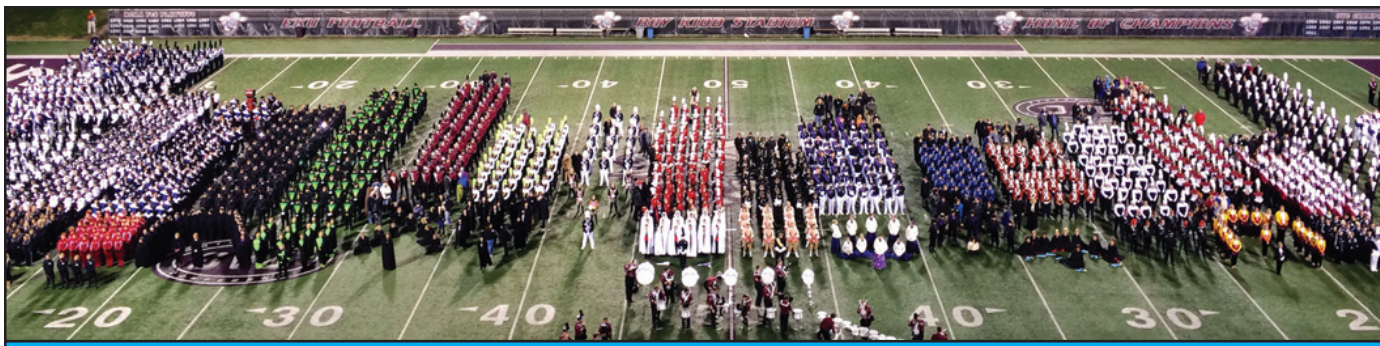
Engineers Marching Band Finishes As State Runner-Up -- Page 16

Tammy Terry's Front Porch Ponderings Page 3