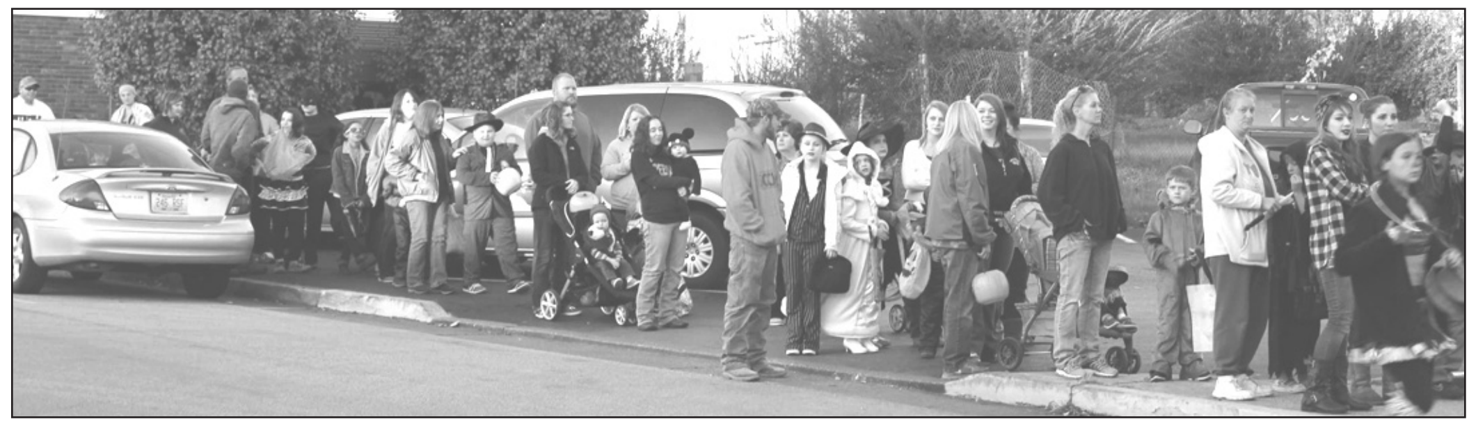
Street. The camera captured a part of the line down to the former location of County Library.