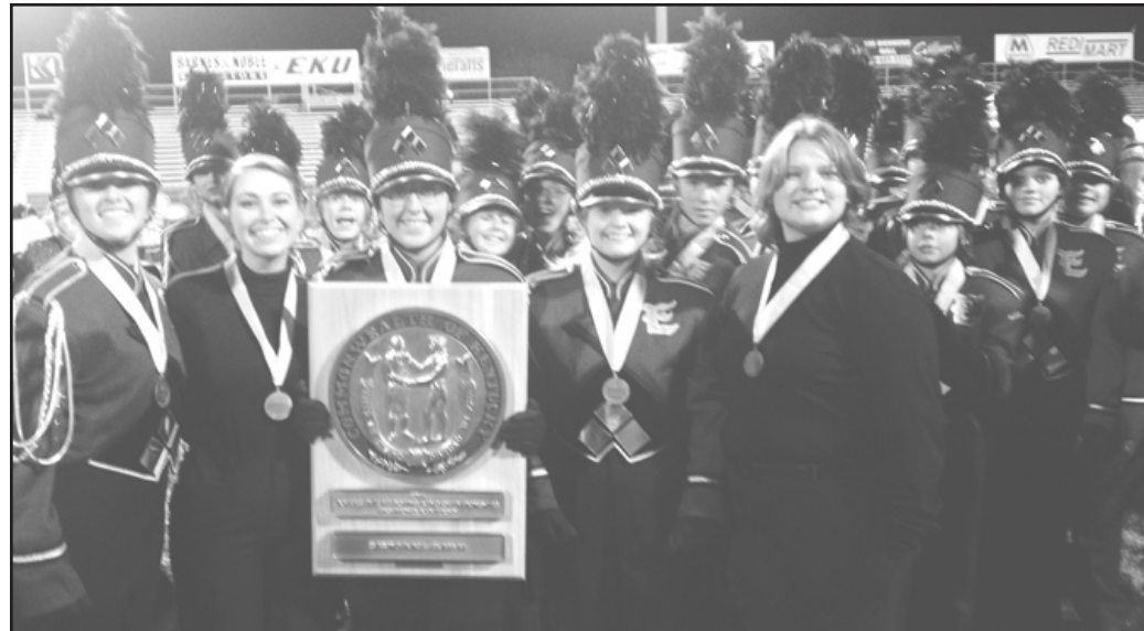
Estill County Marching Band members with their State Runner-Up trophy

A RECEPTION to honor this awesome group of students will be held on Thursday, November 6th at 7:00 PM in the high school auditorium. Everyone in the community is welcome and encouraged to attend. Please come out to help congratulate and honor this band and their accomplishments!!