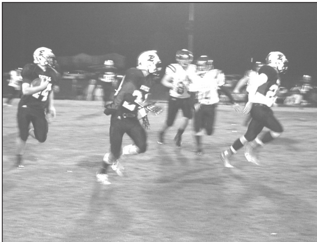
Estill County Engineers have an easy game against McCreary Central