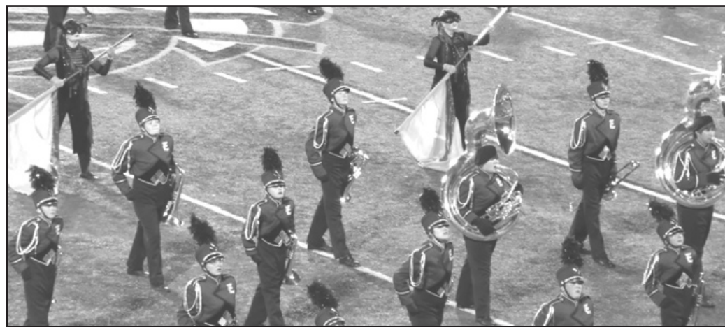
Estill County Marching Band members on the field in state competition

Cox Insurance, Inc. 606-723-4013 407 Richmond Road Irvine, Kentucky