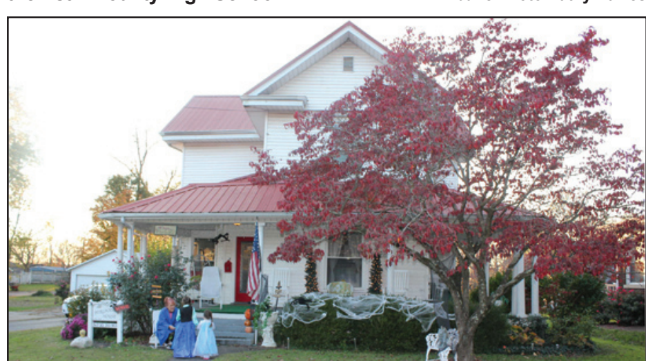
Trick or Treaters went to the bed and breakfast on Main Street, which was decorated for fall and Veterans Day.