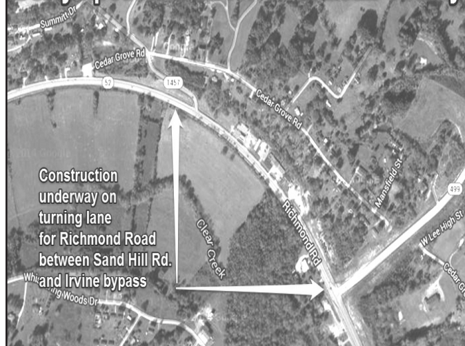
KY-52 Richmond Road Construction Map