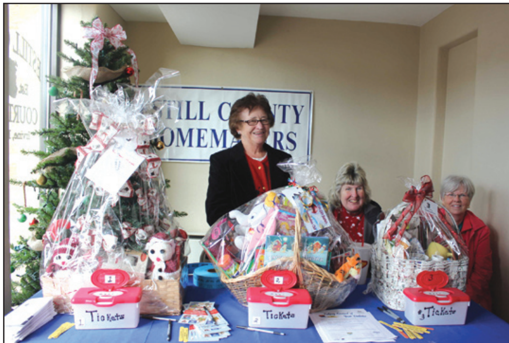
Estill County Homemakers accepted donations for baskets to raise funds for their organization.