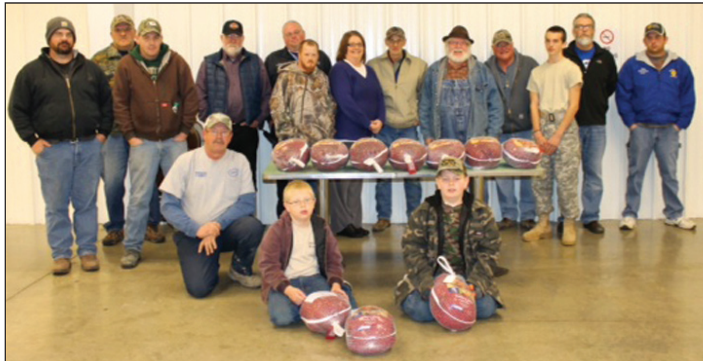
Estill County Longbeards of the National Wild Turkey Foundation share through the turkey hunters care program. Volunteers from the local chapter of the NWTF provided turkeys for families in need during the thanksgiving holiday.

Thanksgiving, 2014 Visit us at SowerMinistries.org