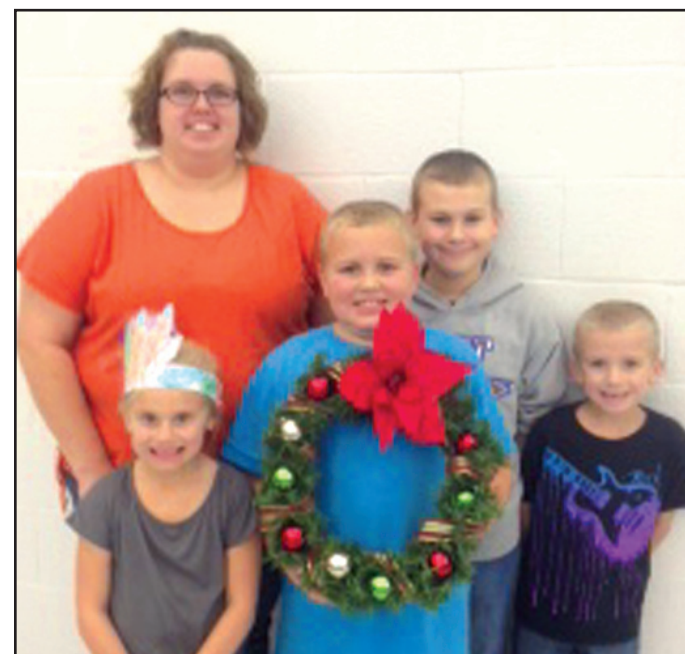
The Estill County Middle School Youth Services Center recently held a "Gather Around the Table of Thanks" Family Fun Night. Twenty-seven families totaling 83 people participated in the event. During this event the families enjoyed a nice Holiday style meal and then worked together to create a holiday wreath for their home. Students from the Estill County Middle School Student Leadership Initiative Program assisted in serving the meal as part of their community service program. The next ECMS/YSC Family Fun Night will be a family movie night on December 11, 2014, from 5:30-7:30 and will feature a free holiday movie and refreshments. If you would like to attend this event please register with the ECMS/YSC by calling 606-723-6840.