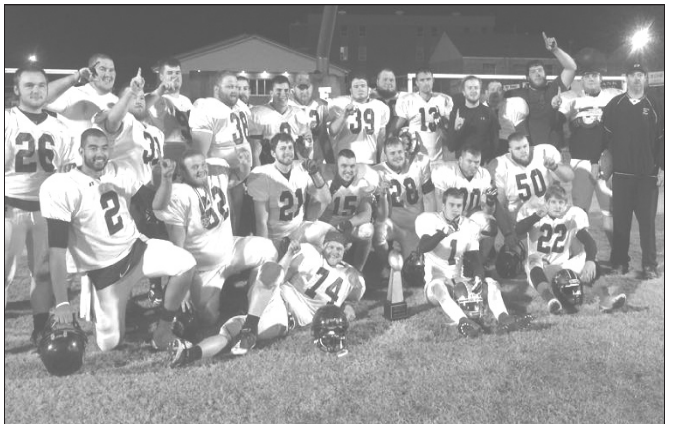
2014 Estill County Engineers Alumni Football Team Winners over the Powell County Pirates Alumni, 29-6