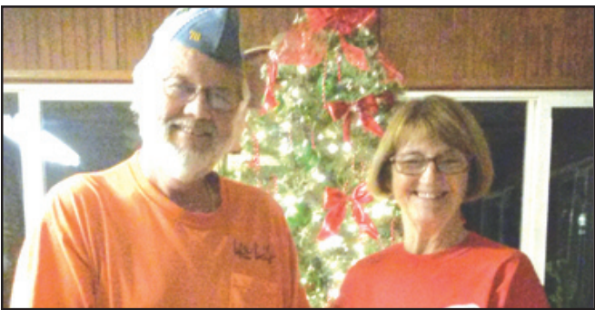
Saving The Mack Theatre – See 4