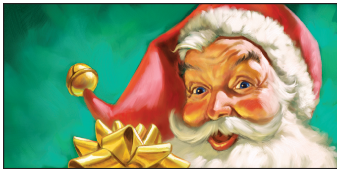
Letters to Santa – Page 14-18