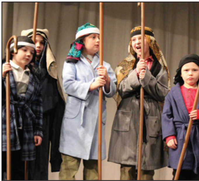
There were shepherds, three wiseman, and an angel choir (not pictured) in "The Best Little Christmas Pageant Ever." The five shepherds, one is partially hidden, are pictured above.