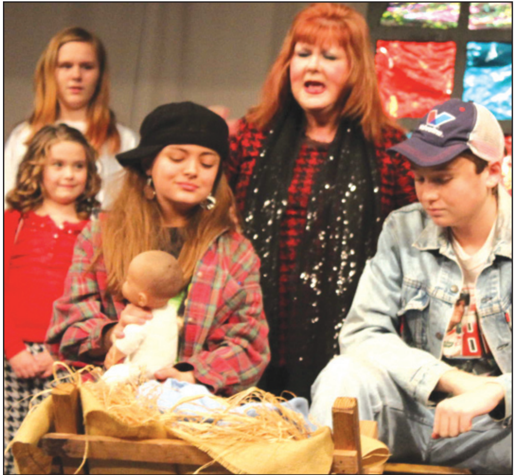
River City Players presented "The Best Christmas Pageant Ever" on Saturday night and Sunday. The play is a play within a play and has a large cast of children. Above, was the rehearsal scene in the play.