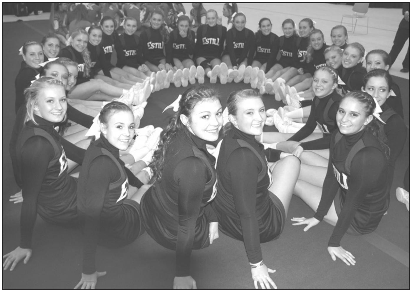
2014-15 Estill County Engineers Cheerleaders 4-Place in State

14th Region teams, Owsley County finished 12th the the All-Girl Large Division, Letcher Central finished 2nd in the All-Girl Medium Division, Perry Central finished 5th in the All-Girl Small Division, Knott Central finished 5th in the Coed A Division, and Jenkins finished 7th in the Coed B Division.