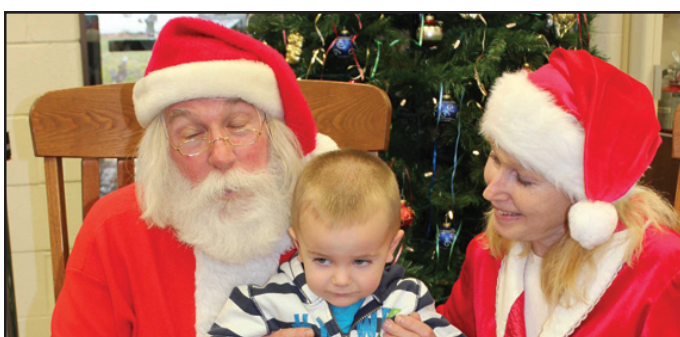
Santa's Early Visits – Page 17