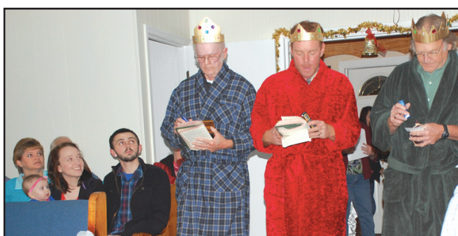
Pine Hill Christmas Play – Page 2

Tammy Terry's Front Porch Ponderings Page 7