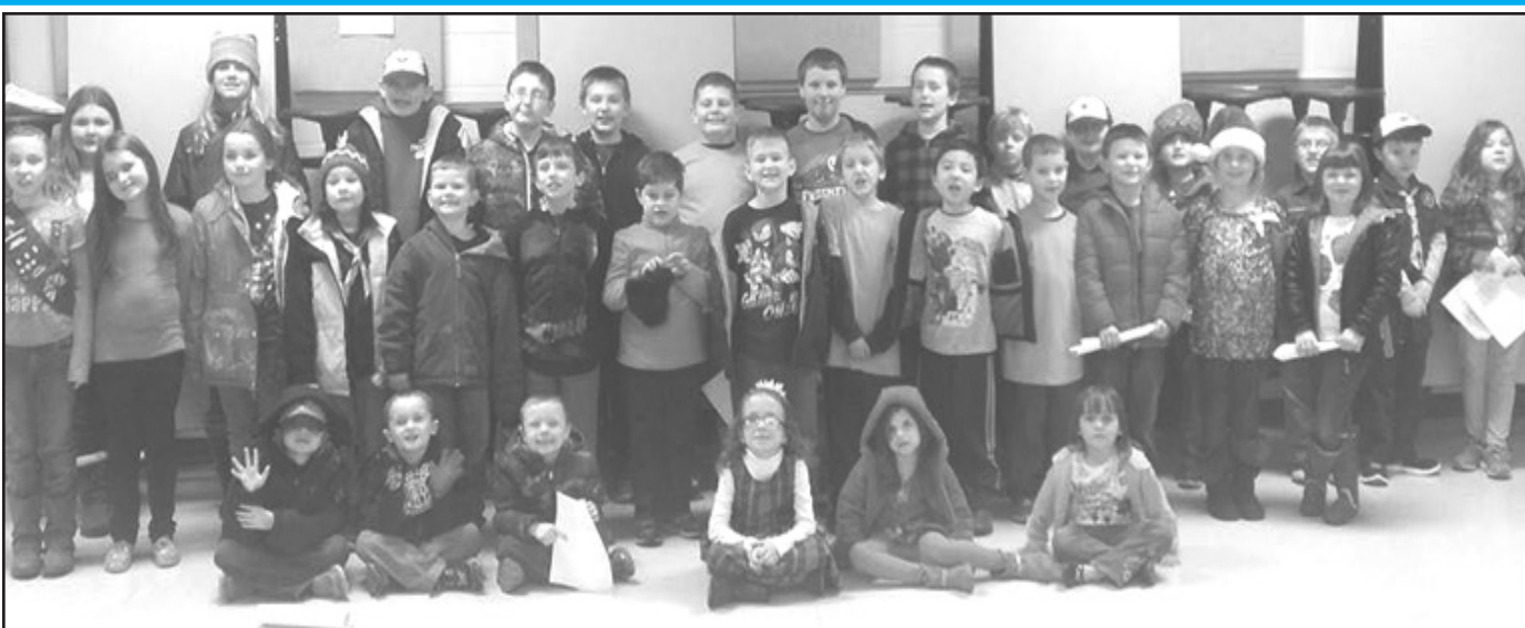
The Cub Scout Pack 144 and Girl Scout Troops 7180, 7181, 663, & 337 went caroling down Gevena Ave. We would like to tell the people of Estill County a Merry Christmas and Happy New Year!!!!