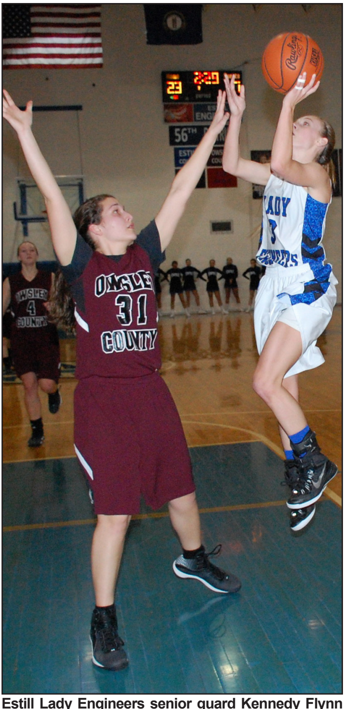
Action between Rose's Blue and Hall's Green 4th & #3 white puts up a shot over the Lady Owls defender. Flynn scored 29 points in three straight games.