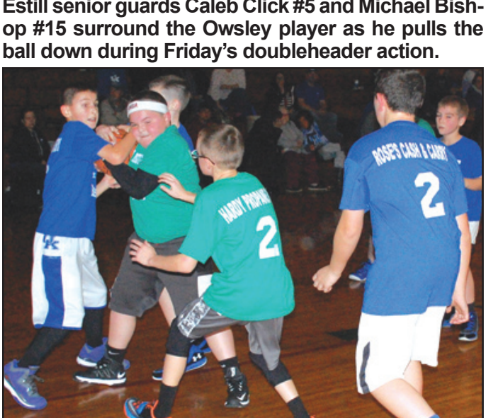
5th grade teams in Primary League action Monday.