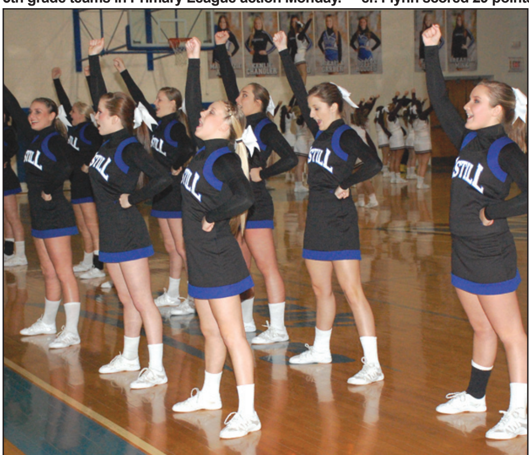
The Estill County Engineers Cheerleaders work hard to keep things lively at both the girls and boys games during the Estill-Owsley doubleheader on Friday.