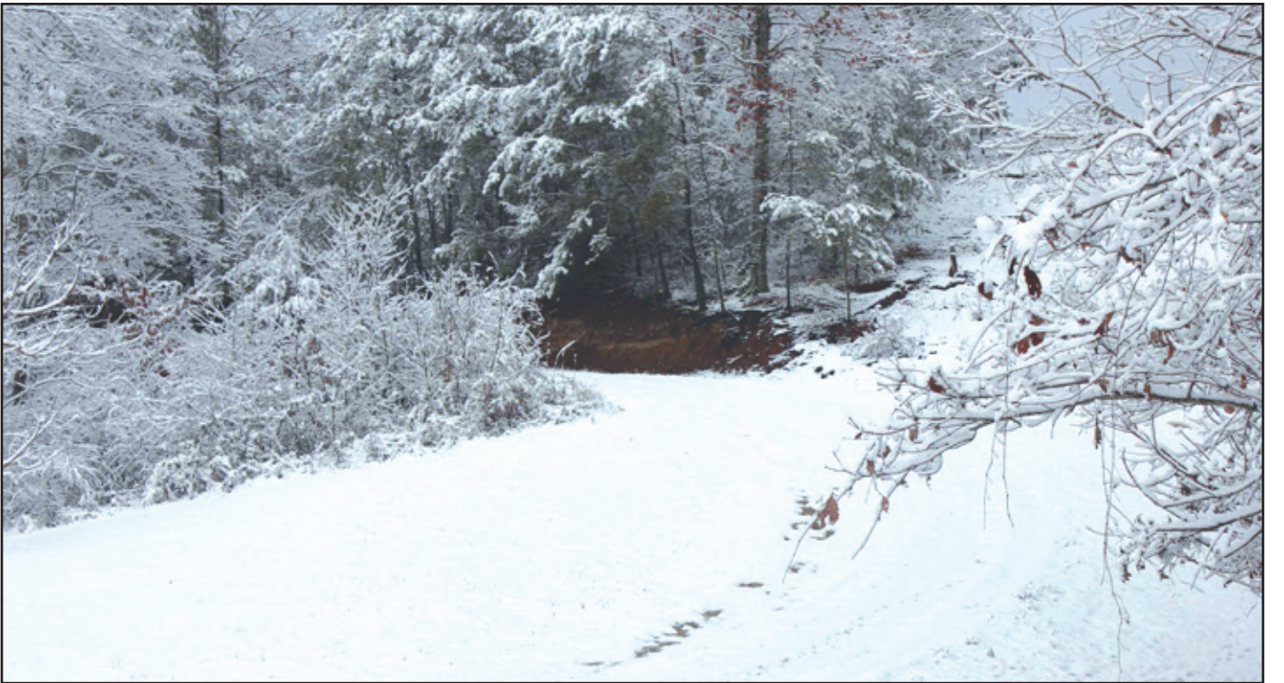
Estill Countians woke up Saturday morning to their first substantial snowfall of 2015, about three inches. Students missed their fifth day of class on Tuesday. A few days, school was dismissed because of the cold or just plain ice. The school board is looking at a plan that some other systems are using this year where students will do their class work at home on snow days.