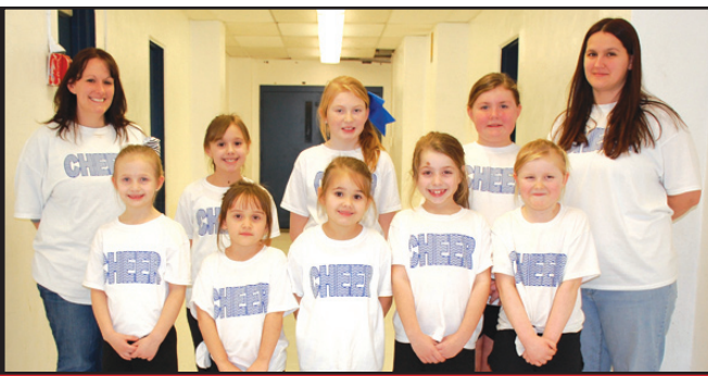
Primary League 4th & 5th Grade Teams & Primary Cheerleaders – Page 15