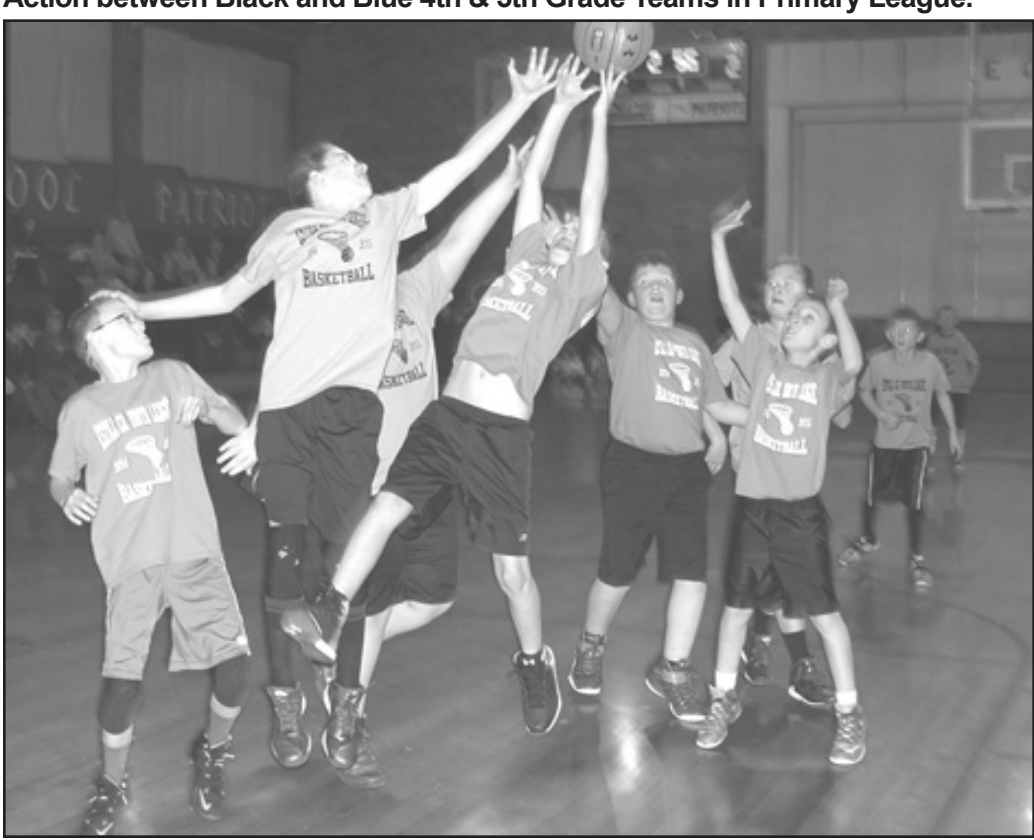
Light Blue and Green teams fight for the rebound in Primary League action.