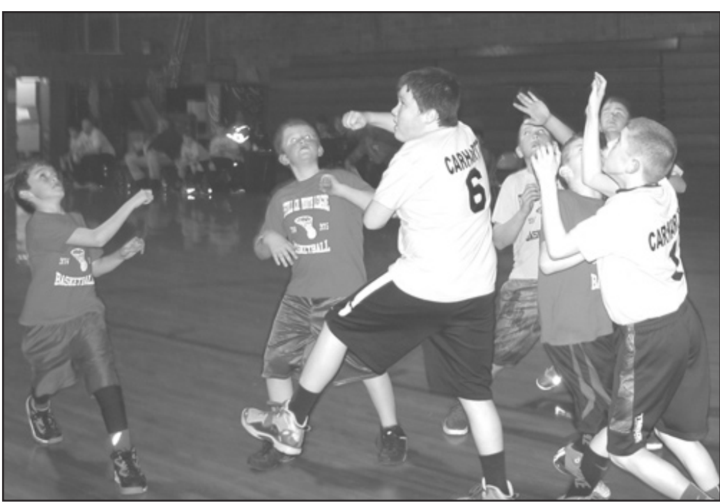
Primary League teams Red and Yellow matched up last Thursday.