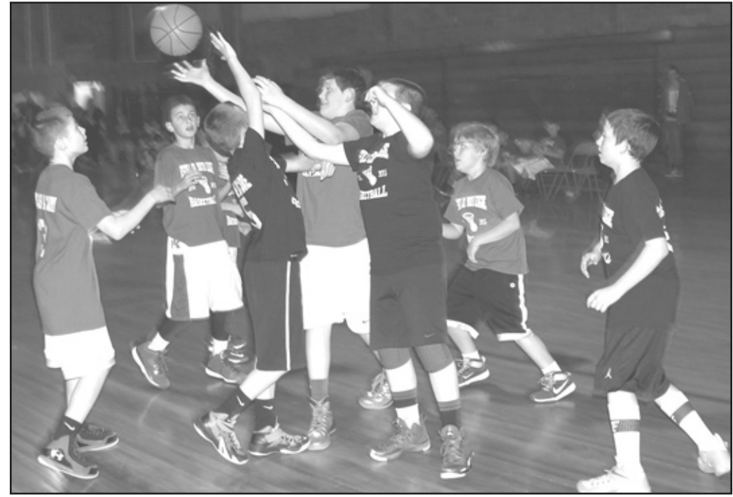
Action between Black and Blue 4th & 5th Grade Teams in Primary League.