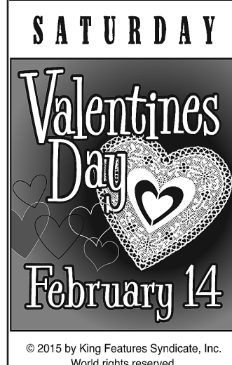
© 2015 by King Features Syndicate, Inc. World rights reserved.