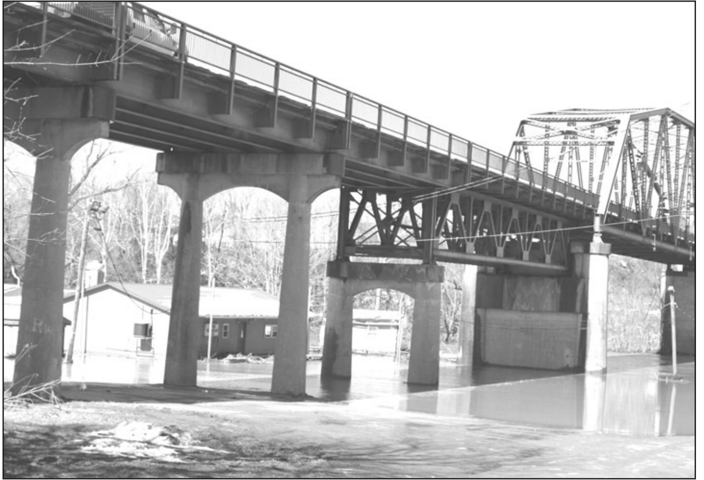
Rader's River Grill under the Irvine bridge floated during last week's floods. Water reached the top of the parking lot before it crested on Saturday morning at about 31 feet. Unfortunately for the restaurant owner, more flooding is predicted for this week.

They plan to celebrate their anniversary with their family, including their five grandchildren, who love them dearly and are thankful each day for their union 50 years ago.