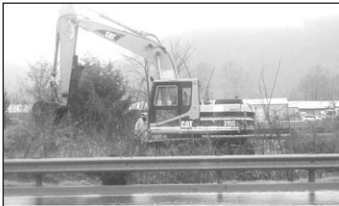
Shortly after homes were flooded on Main Street of Ravenna last Wednesday, heavy equipment was working to clear the drain pipe that goes under CSX Railroad.

Once the tanks have sufficient levels of water, the water will be tested. After the water tests are satisfactory, the boil water advisory will be lifted.