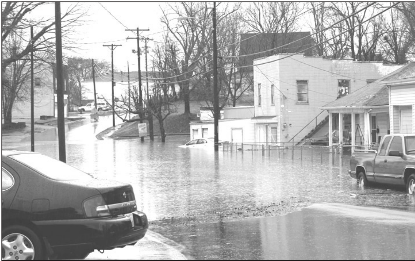
A view from Main Street, Ravenna looking toward Broadway in Irvine. Most of the houses with water damage are on the right side of the street. A white car to the front side of the two story block building is nearly submerged.