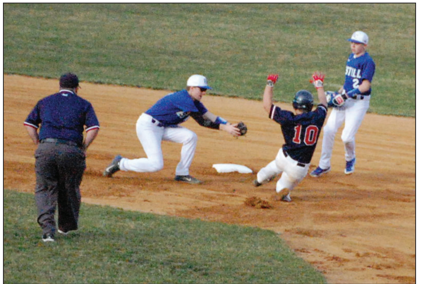
The Estill County Engineers baseball team made a great play at second base on Monday night, picking off the Rockcastle runner to end the first inning.