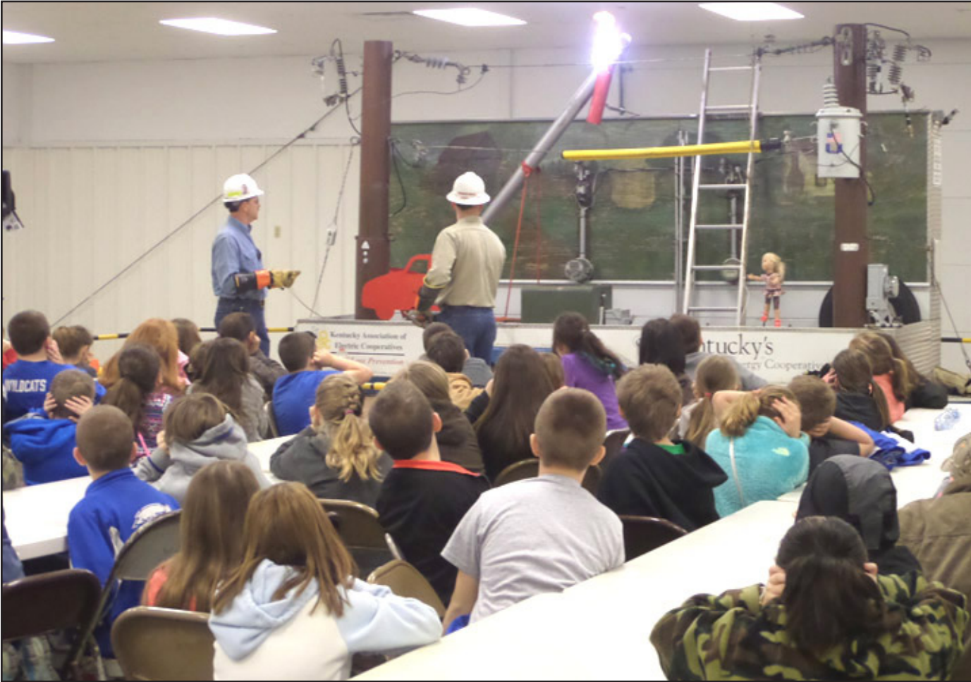
Touchtone Rural Electric Cooperative representatives demonstrated consequences of being careless around electric lines to Estill County's 4th-graders on Thursday.