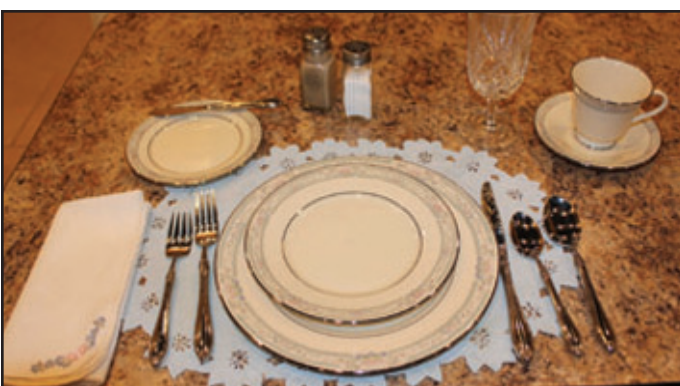
Above is a formal table setting that students observed during their lesson on dining etiquette. Photo right: A student is learning how to set a table. About 30 students went to Michael's Restaurant where this class took place. They plan on using their skills in a few weeks when they go on their senior trip to Washington, D.C.