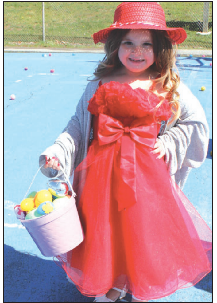
All decked out in red for the egg hunt.