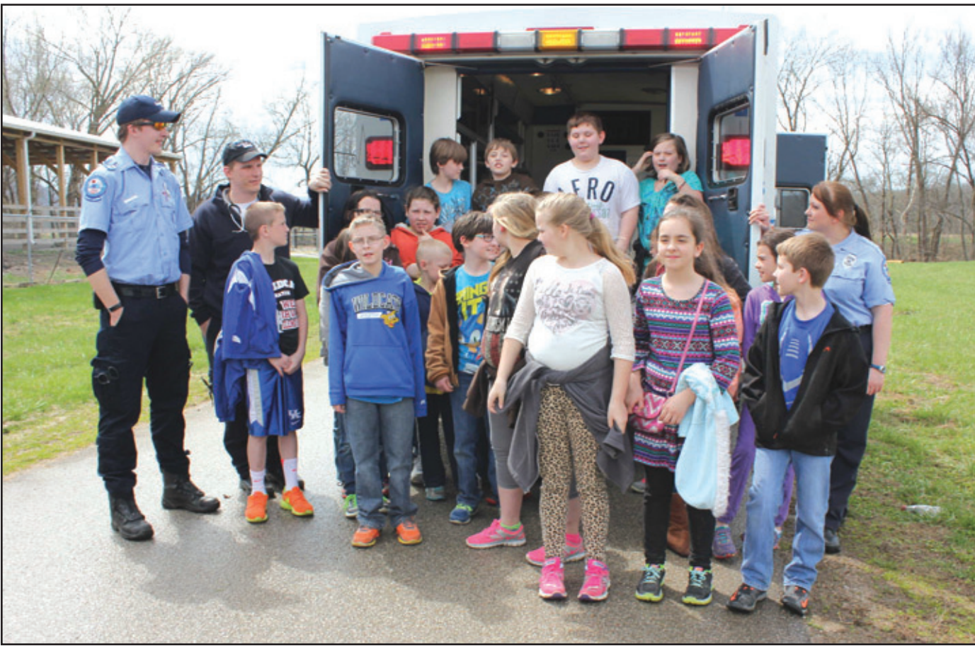
Estill County Emergency Personnel assisted with the mock ATV disaster on Thursday. Above, a class of 45th graders has their picture made in front of an ambulance.