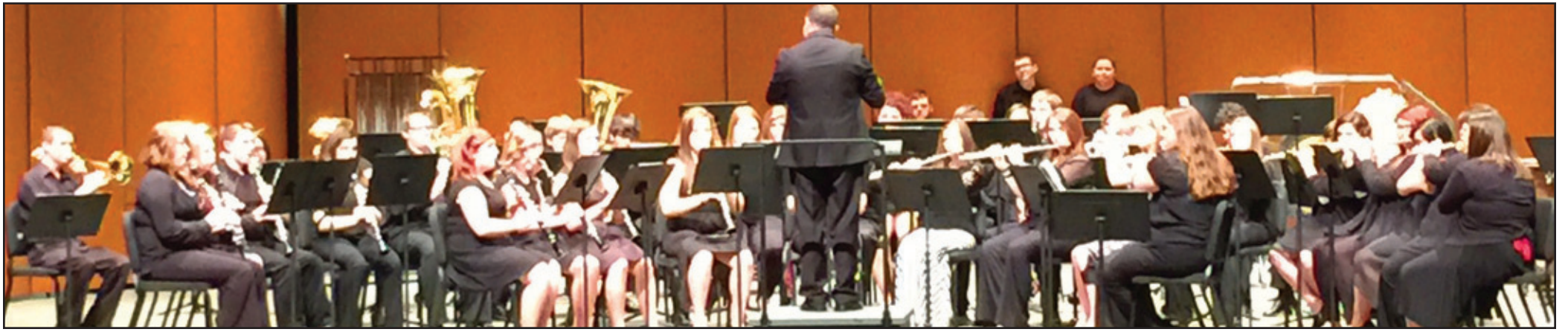
ABOVE: The Estill County High School Concert Band recently participated in their KMEA Spring Concert Band Assessment Event. The band was required to prepare two pieces and perform them for three judges who rate the performance novice, apprentice, proficient or distinguished. The band received ALL DISTINGUISHED ratings from ALL of the performance judges as well as the sight reading judge. The event was held at the EKU Center for the Arts.