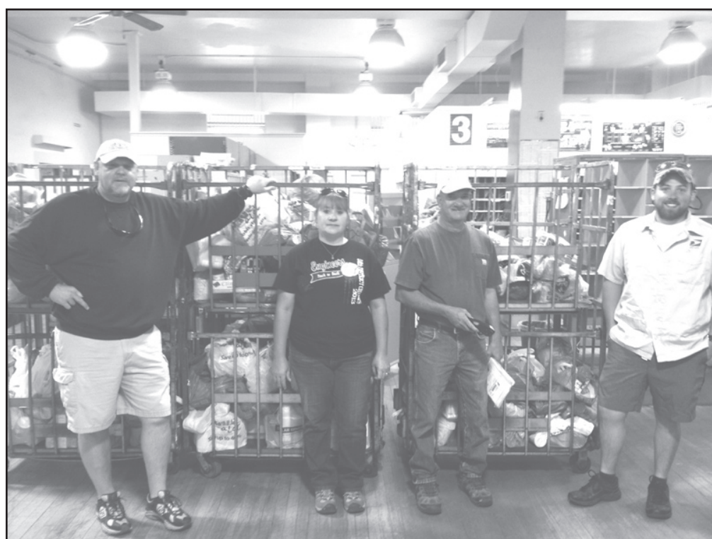
On behalf of the Irvine Post Office and the NALC we want to thank those participants that donated to our annual Food Drive. Thanks to the combined efforts we were able to collect approximately 2500lbs of food for our local food bank.