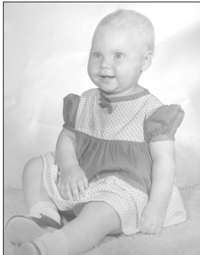
Nifty, Nifty, Look Who's 50 Guess who? We love you!

Rogers, (KY-05), and other leaders, The Center for Rural Development is a non-profit organization fueled by a mission to provide leadership that stimulates innovative and sustainable economic development solutions and a better way of life in Southern and Eastern Kentucky. In its 45-county primary service region, The Center provides innovative programs in leadership, public safety, technology, and arts and culture. The Center is committed to constantly expanding its capabilities in order to deliver a range of key services throughout Kentucky and the nation.