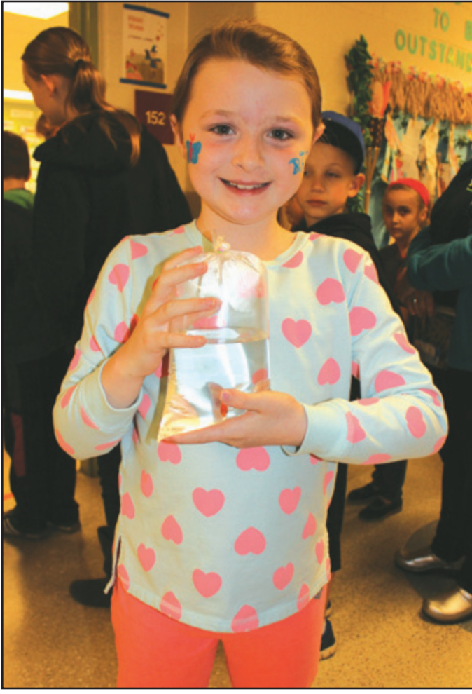
Getting your face painted and winning a gold fish were probably two of the most popular attractions at the West Irvine carnival on Friday evening.