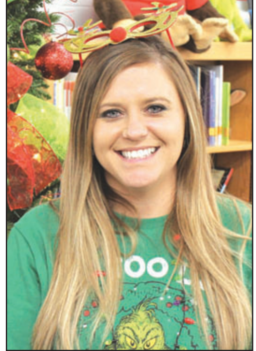
her dedication to her students, her cre- to Estill County Schools and for his dents of Estill County. ativity, and strong leadership ability.