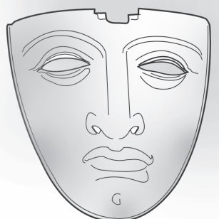
1st-century AD, Roman helmet face mask

© 2019 by King Features Syndicate, Inc. World rights reserved.