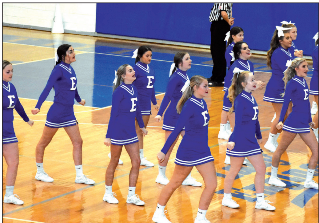
Estill Engineers cheerleaders pep up the crowd during the Estill-Powell game.