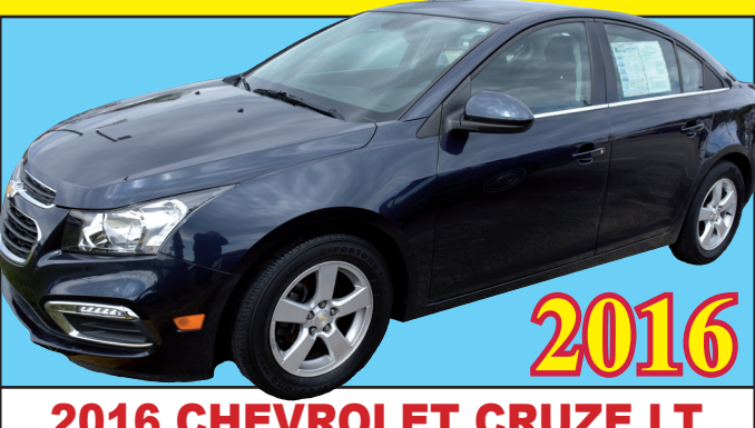
4-DOOR, LOADED! LOW MILES! FACTORY WARRANTY! WE HAVE FINANCING!