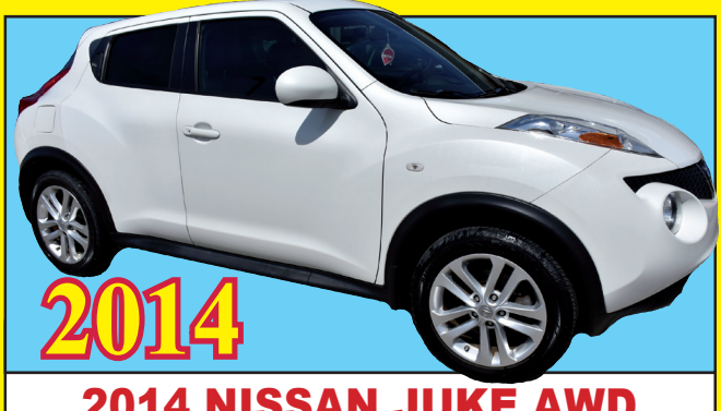
2014 NISSAN JUK LOCAL TRADE! ONLY 30.000 MILES! COME AND SEE! WE HAVE FINANCING!