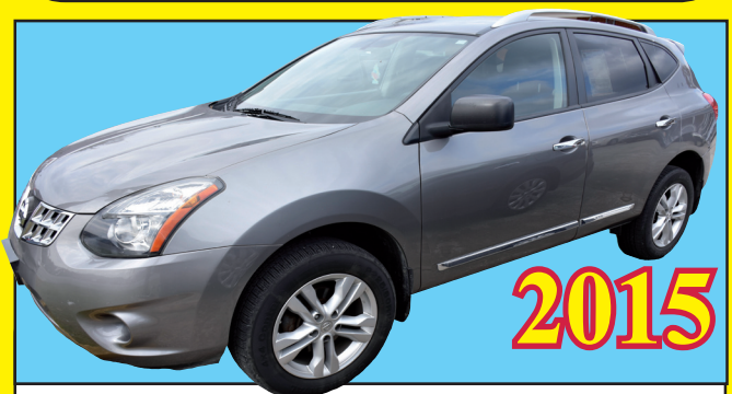
2015 NISSAN ROGUE AWD

2002 NISSAN PICKUP Auto, AC, Ext. Cab. . $2995.