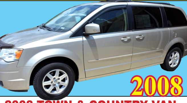
CHRYSLER! LOADED POWER EVERYTHING! LOCAL TRADE! WE HAVE FINANCING!