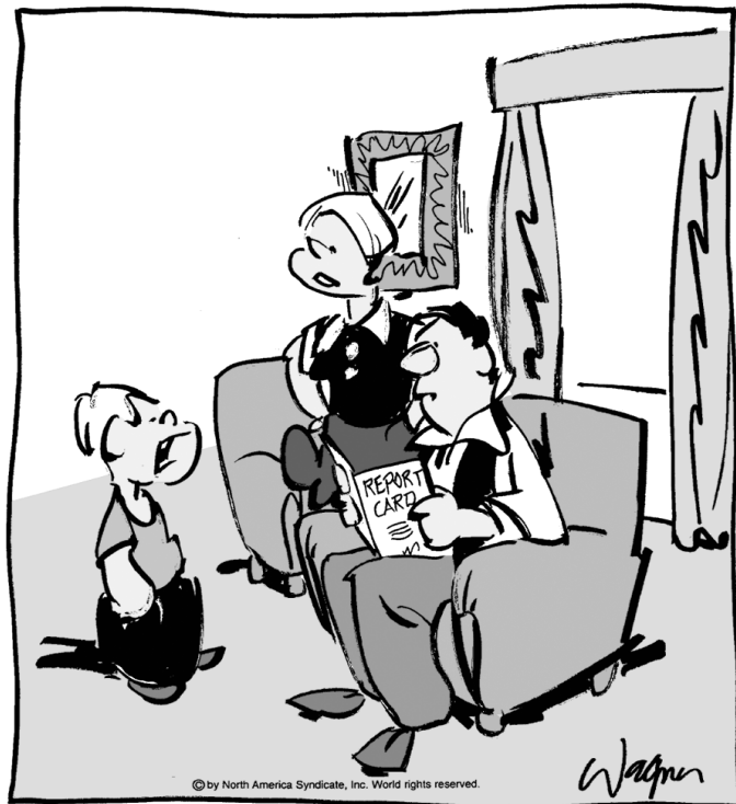
"It's the best I can do with an uncool backpack."