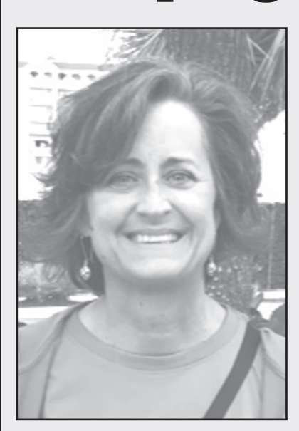
by Dawn Reed Eastern Ky. Columnist

It didn't look like much-all larger, fatter replacement. mashed down and squished into the box.