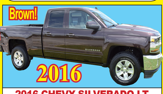
2016 CHEVY SILVERADO BROWN! 4-DOOR AND LOADED! FACTORY WARRANTY! WE FINANCE!

We work with the BB&T and Community Trust Banks: But we'll work with any bank or credit union to get you the best rate on a loan!