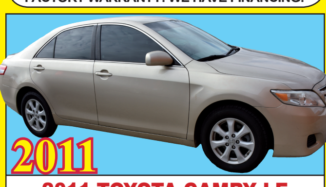
2011 TOYOTA CAMRY LE 4-DOOR! AUTOMATIC! NICE CAR! LOW MILES! WE HAVE FINANCING!