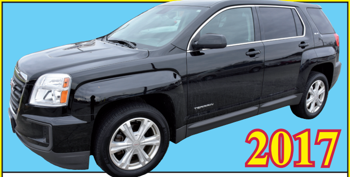
2017 GMC TERRAIN 4-DOOR, AWD! ONE-OWNER! ONLY 28,000 MILES! WARRANTY! WE HAVE FINANCING!