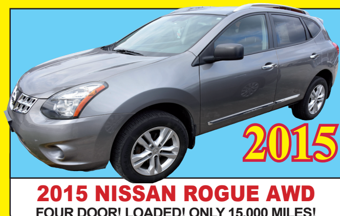
FOUR DOOR! LOADED! ONLY 15,000 MILES! FACTORY WARRANTY! WE HAVE FINANCING!