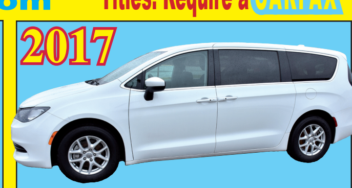
7-PASSENGER! LOADED! ONLY 16.000 MILES! FACTORY WARRANTY! WE HAVE FINANCING!