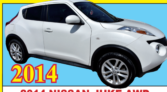
LOCAL TRADE! ONLY 30,000 MILES! COME AND SEE! WE HAVE FINANCING!