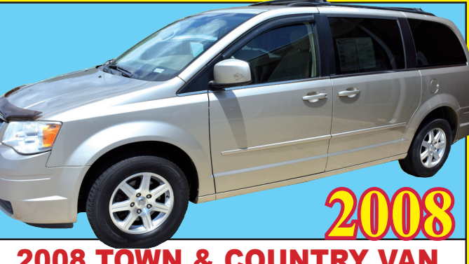
2008 TOWN & COUNTRY CHRYSLER! LOADED POWER EVERYTHING! LOCAL TRADE! WE HAVE FINANCING!