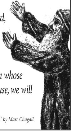
Detail of "The Exhortation of Joshua" by Marc Chagall

And if it seems evil to you to serve the Lord, choose for yourselves this day whom you will serve, whether the gods which your fathers served that were on the other side of the River, or the gods of the Amorites, in whose land you dwell. But as for me and my house, we will serve the Lord. JOSHUA 24:15