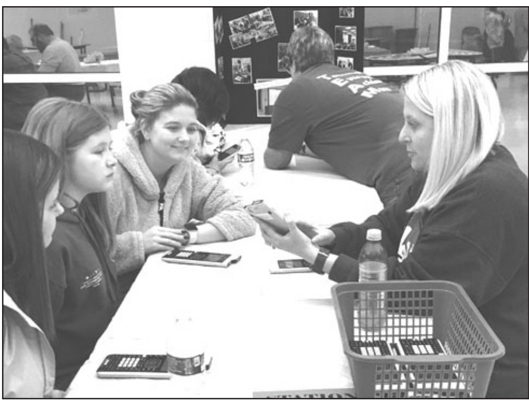
cluded learning about robotics, chemical reactions, and much more. The Youth Service Center and GEAR UP Opportunity are offering monthly Family Learning Nights similar to this one, if you would like to attend please contact the school for upcoming dates.