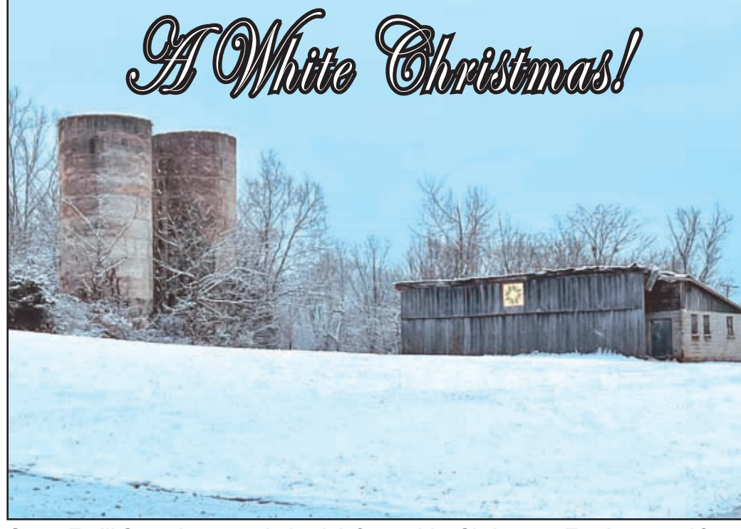
Some Estill Countians got their wish for a white Christmas. Totals ranged from four inches and up. The snow was beautiful but it came with a price. Many accidents were reported on Christmas Eve night, and a lot of people were stranded. By noon Saturday, most roads were passable. The above scene was on Wisemantown Road.