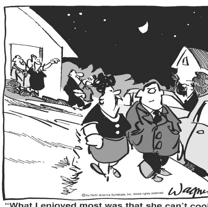
What I enjoyed most was that she can't as well as me!