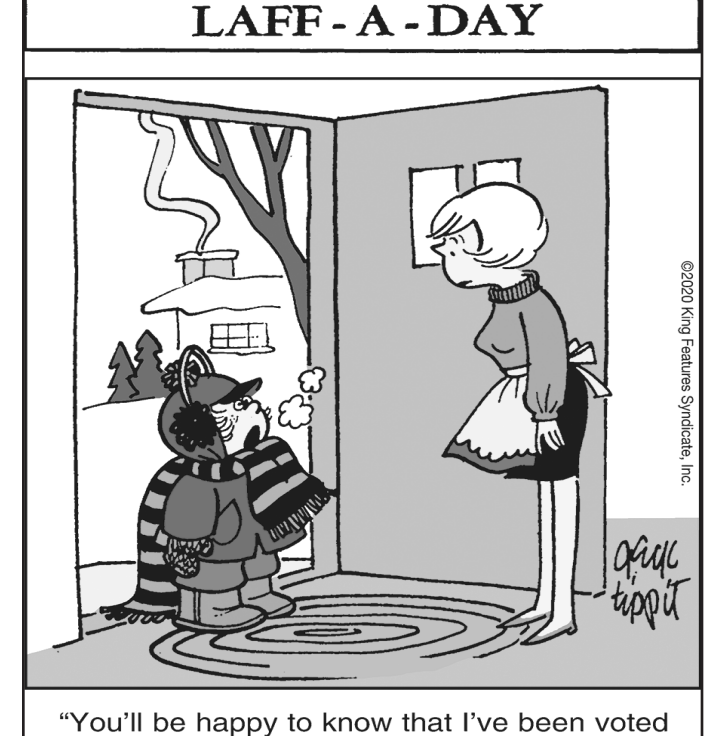
the most-dressed girl on our block!"

Judging will take place on December 11th and awards will be distributed on December 12th.