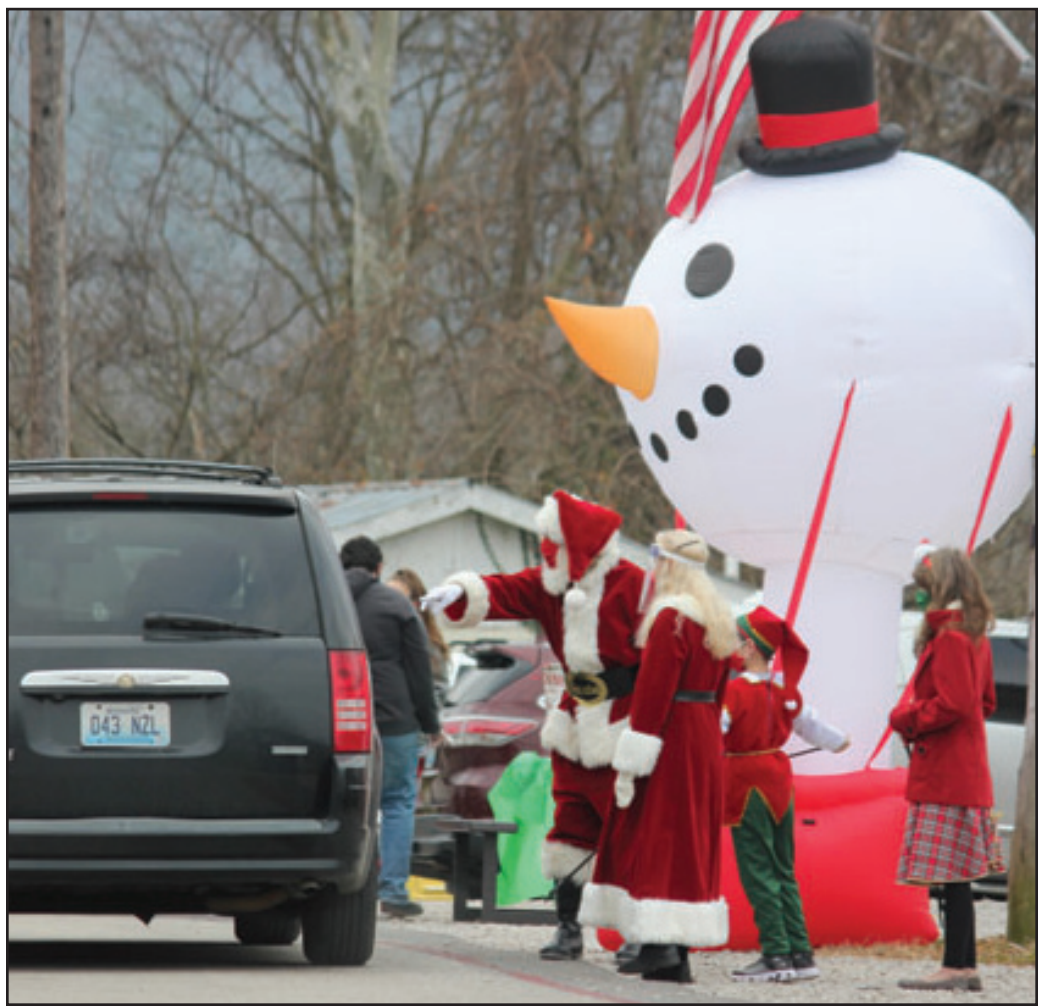
Santa is shown in front of Back Street Grub, where vehicles in the drive-through stopped and the children got another stuffed animal from that business.