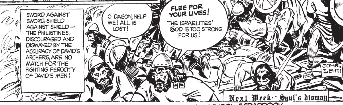
Next Week: Saul's dismay SAVE THIS FOR YOUR SUNDAY SCHOOL SCRAPBOOK