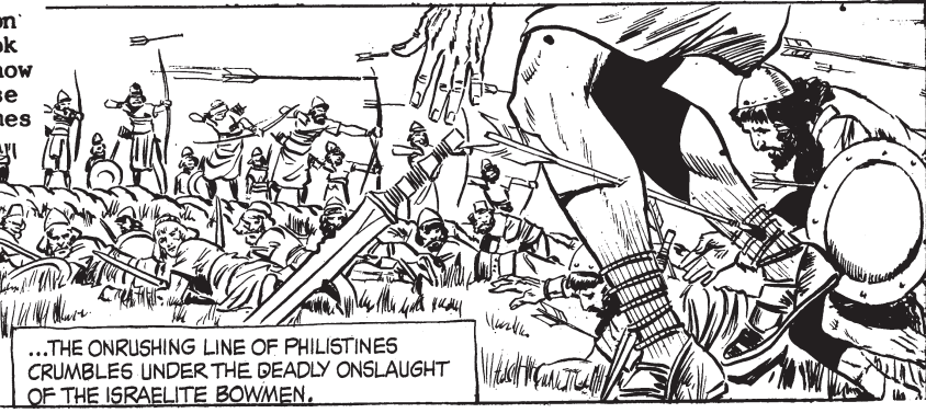
...THE ONRUSHING LINE OF PHILISTINES CRUMBLES UNDER THE DEADLY ONSLAUGHT OF THE ISRAELITE BOWMEN.