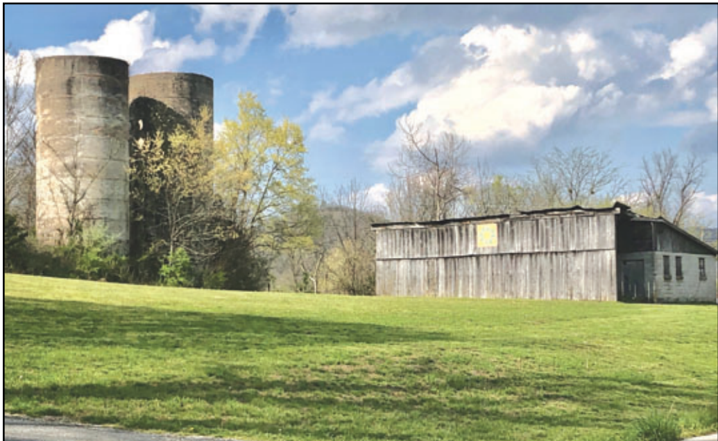
The old silos on Wisemantown Road provide a scenic view with leaves budding.