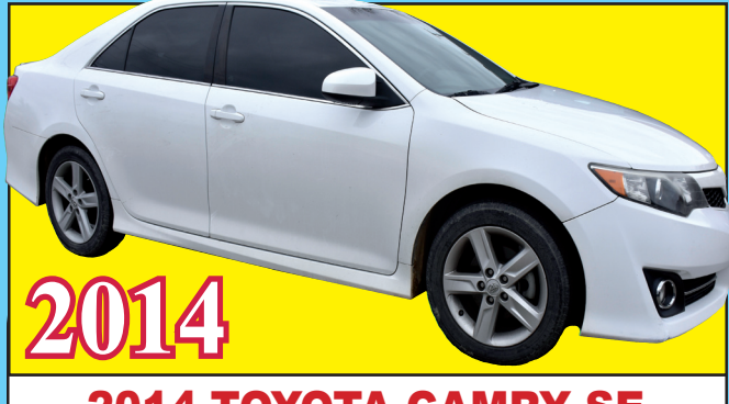
2014 TOYOTA CAMRY SE

FOUR DOOR! LOADED! ONLY 15,000 MILES! FACTORY WARRANTY! WE HAVE FINANCING!