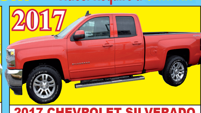
4-DOOR, 4X4! NICE TRUCK! ONLY 19,000 MILES!