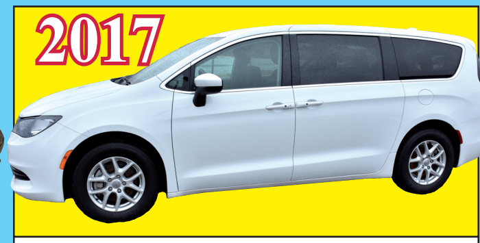
2017 CHRYSLER PACIFICA

4X4! LEATHER! LOCAL TRADE! WE HAVE FINANCING!