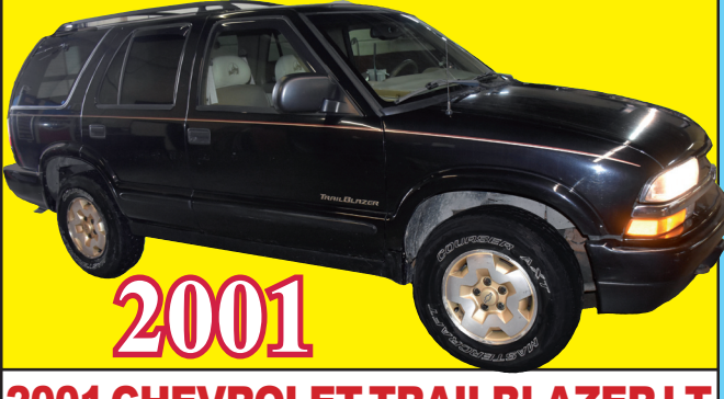
2001 CHEVROLET TRAILBLAZER LT

4X4! LEATHER! LOCAL TRADE! WE HAVE FINANCING!