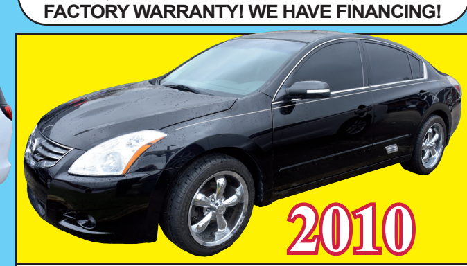
2010 NISSAN ALTIMA 4-DOOR! LOADED! LOCAL TRADE!

7-PASSENGER! LOADED! ONLY 16,000 MILES! FACTORY WARRANTY! WE HAVE FINANCING!