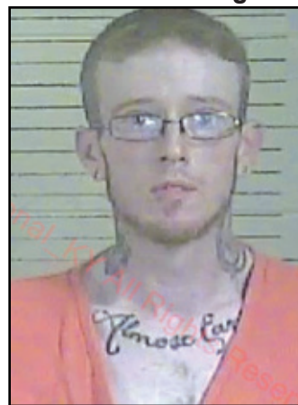
Timothy Powell Photo/3 Forks Jail