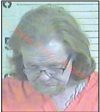
Bradley Young Photo/3 Forks Jail