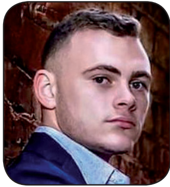
Cole Thomas Willis Charles Vanhuss Memorial Scholarship