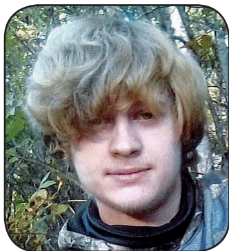
Joseph Lee Williams Technical Math Award