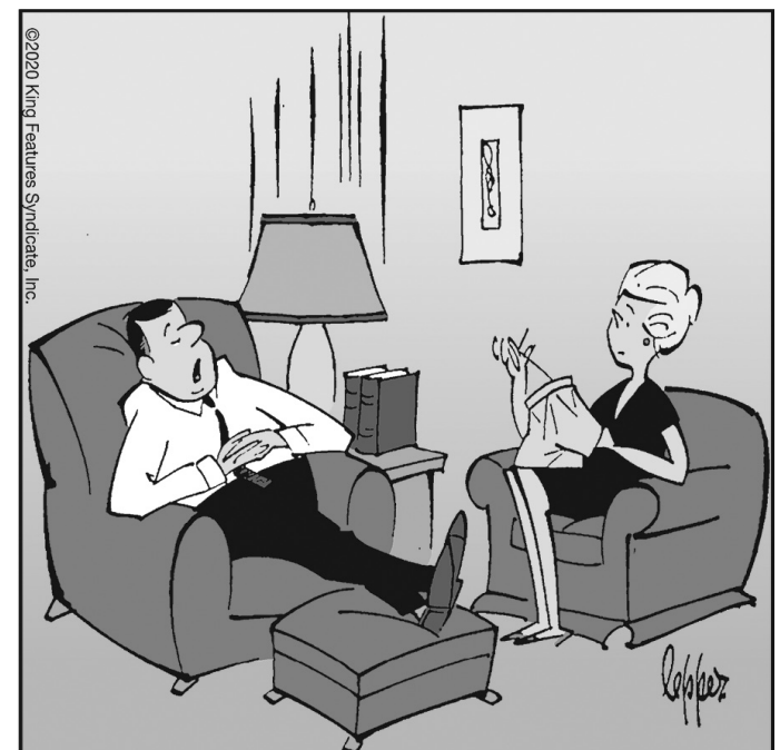
"Remember the good ol' days when we dreamed of owning all the things we're now making payments on?"

"Test Your Bible Knowledge," with 1,206 multiple-choice questions by columnist Wilson Casey, is available in bookstores and online.