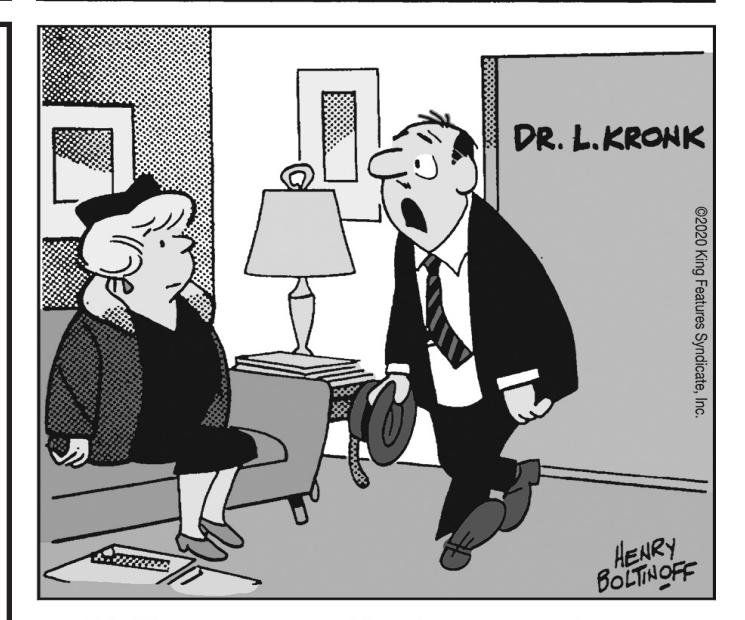
"He'll never get my blood pressure down at