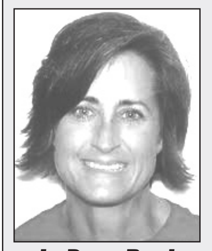
by Dawn Reed E. Ky. Columnist

alarm, everything is fine." I the buttermilk. I patted out time. texted our neighbor after it the biscuits into round shapes up emoji.